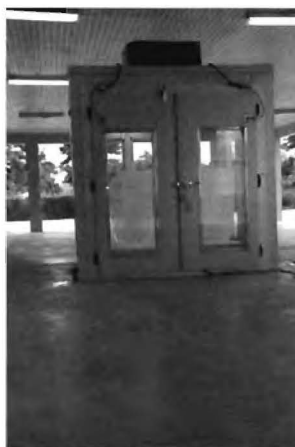
Solar Powered Freezer

that he encapsulated in a solar-powered refrigerator serves as a metaphor of nature placed on life-support, turning it into a strange futuristic assemblage. It is ironic