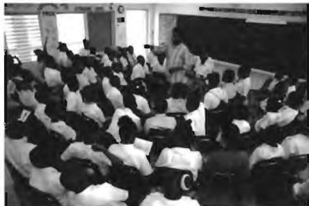
Empty Hands #6, Performance at Ridgland Park Primary School Nassau, Bahamas.

In July 2006 the recent Yale MFA sculpture graduate Tavares Strachan first presented in his hometown of Nassau the monumental Chamber with Ice: Elevator for the Reversal of Up and Down . 1 It is the main segment of the installation The Distance Between What We Have and What We Want that he would exhibit in its entirety six months later in Miami. 2 Chamber with Ice consists of a specially built refrigerator with glass doors housing a block of ice weighing 4.5 tons, which Strachan collected in the Arctic Circle. The Nassau presentation of The Distance Between... , featuring Chamber with Ice , incorporates an array of solar panels together with a generator, which harnesses and conducts this power in order to run the refrigerator. This piece is punctuated with a specially designed flag and a guard wearing a variation on the Bahamian dress uniform. Strachan arranged for the components comprising the first presentation of The Distance Between... to be placed both under and adjacent to the expansive roofed section of the playground adjoining the Nassau-based Albury Sayle Primary School where he had once been a student.