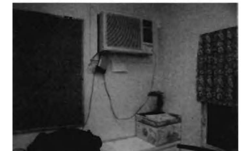
Internet connection at the school