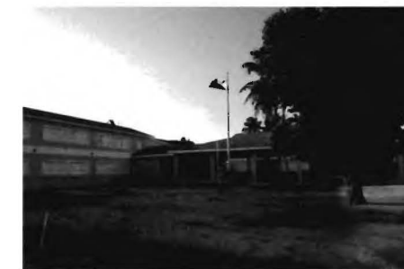
The Sentry stands guard at the School grounds.

This attendant was dressed in a uniform that looks like the colonial ones still worn by guards standing outside some of Nassau's official government buildings, except for the fact that it was made of the same aquamarine blue as the Bahamian flag. Dressed in this way the guard's custom-made uniform both signals official sanction at the same time that it undermines it.