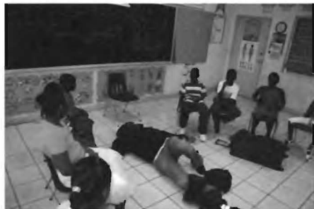
Empty Hands #4, Performance at Ridgland Park Primary School Nassau.

Granted permission to present a series of lecture/workshops to children enrolled in this and other Nassau schools