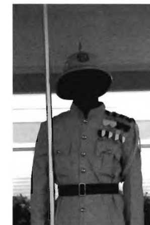
The Sentry, used practically as a unit of protection and a revision of the British guard.

The erasure of boundaries was also a subtext to the performance inaugurating the presentation of The Distance Between... in Nassau. For this low-key performance, Strachan arranged for a guard to stand at attention throughout the evening.